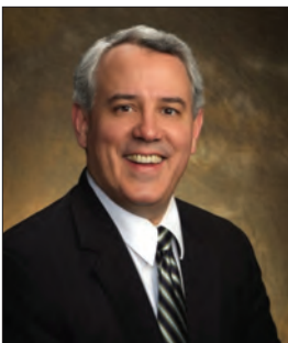
Mayor David Bieter

Visit www.accem.org for the December 2010 Emergency Preparedness Pointer provided by ACCEM (Ada City-County Emergency Management).