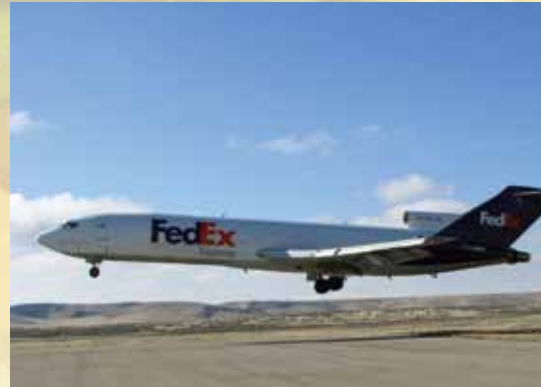
In February the City received a Boeing 727 from FedEx for emergency training.

Last May, Mayor Bieter joined with our entire congressional delegation in celebrating their combined effort to keep Boise's TRACON (Terminal Radar Approach Control) system, and the jobs it supports, here at home. By keeping TRACON in Boise, we preserve high-quality local jobs, ensure continued safety and convenience for travelers, and protect the airport's position as a major hub for aviation and commerce. Retaining the system also helped save taxpayer dollars by avoiding the estimated increased cost of moving the system to another area.