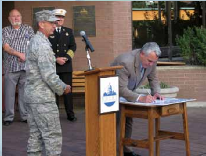
Mayor Bieter signs the Community Covenant to support our soldiers and their families.

As he launched the program, Mayor Bieter urged everyone in our community, from local businesses to individuals, to do whatever they can to lend a hand with the military families in their area. "Whether it's volunteering to do the weekly shopping, delivering a prepared meal or just raking your neighbor's lawn, there are many ways we can repay these families for their service to our nation," Mayor Bieter said.