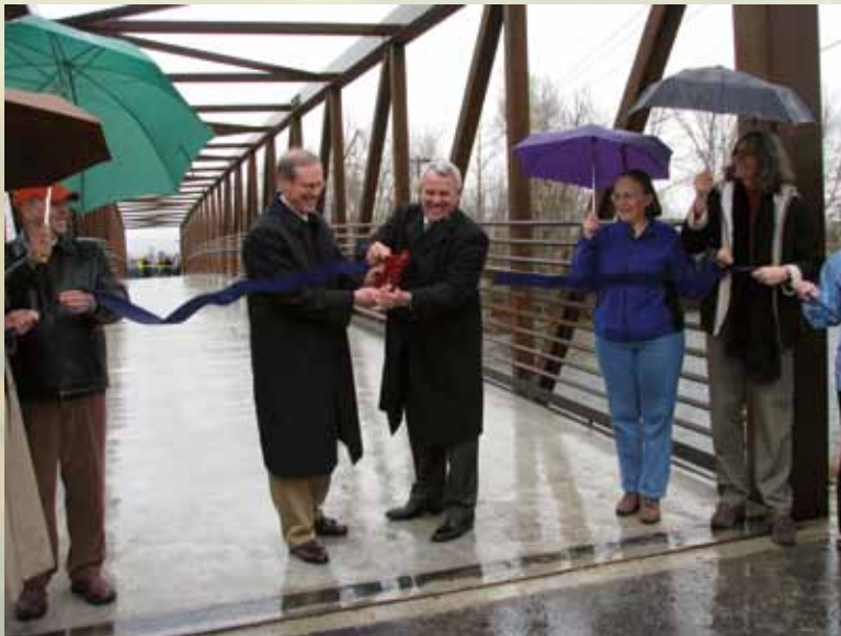
Mayor Bieter and Garden City Mayor John Evans cut the ribbon on the new 36th Street Bridge.

The successful LED streetlight project was finished in May, with more than 2,000 LED lights installed across the city, including many historic lights in Downtown Boise. The 60-percent energy savings will reduce the City’s carbon footprint and save taxpayers $50,000 a year in power costs.