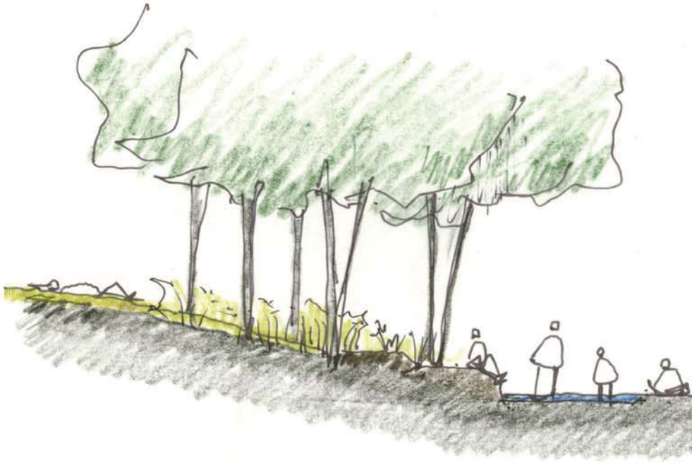
diversion channel / water play