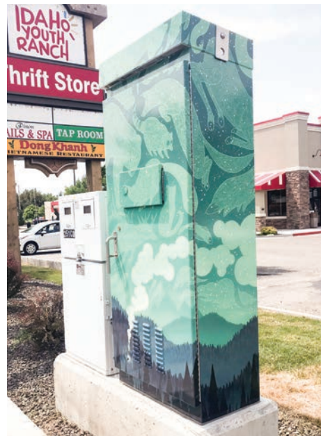
The Sentinel by Ben Konkol in the South Boise Village Neighborhood