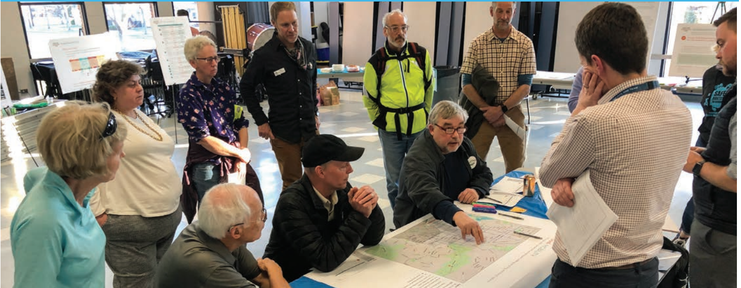
Participants share feedback at the North End Neighborhood Plan Open House