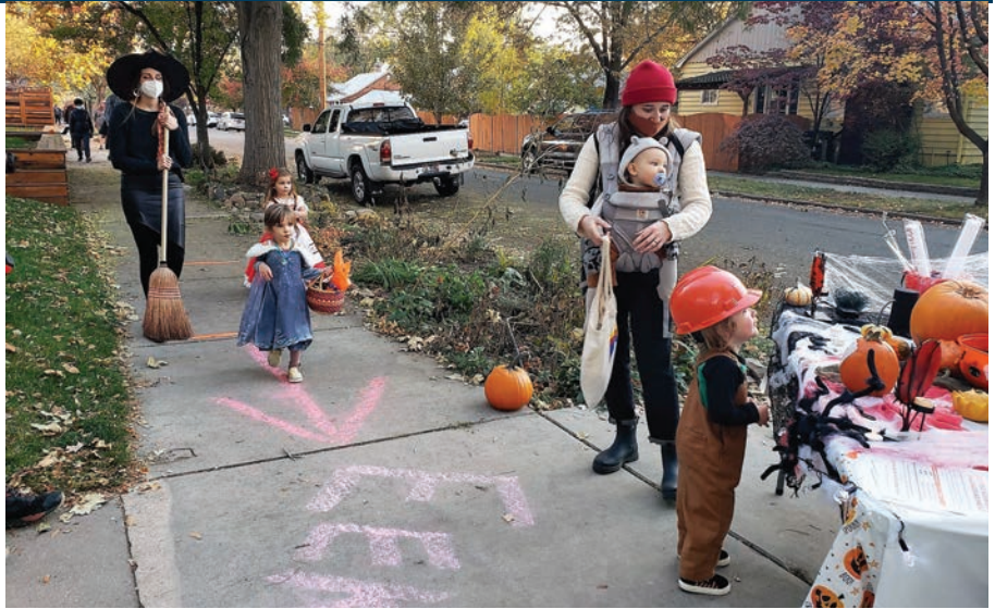
West End Halloween Walkabout