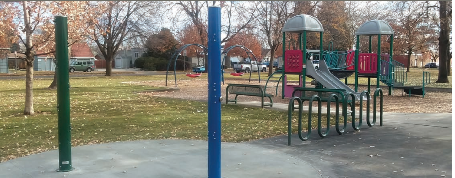
Water feature in the West End's Fairview Park