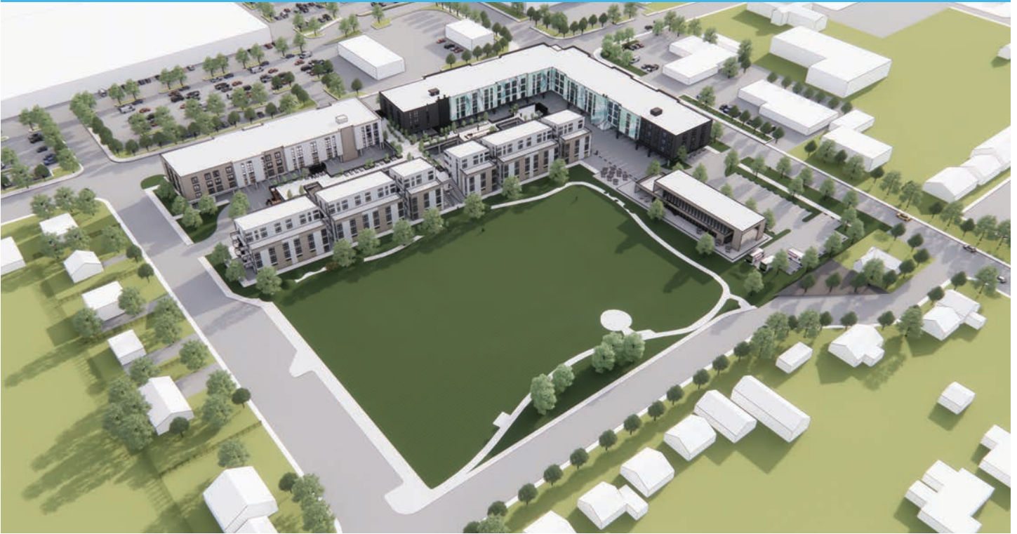
Stakeholders in the Central Bench area provided feedback regarding the future site design