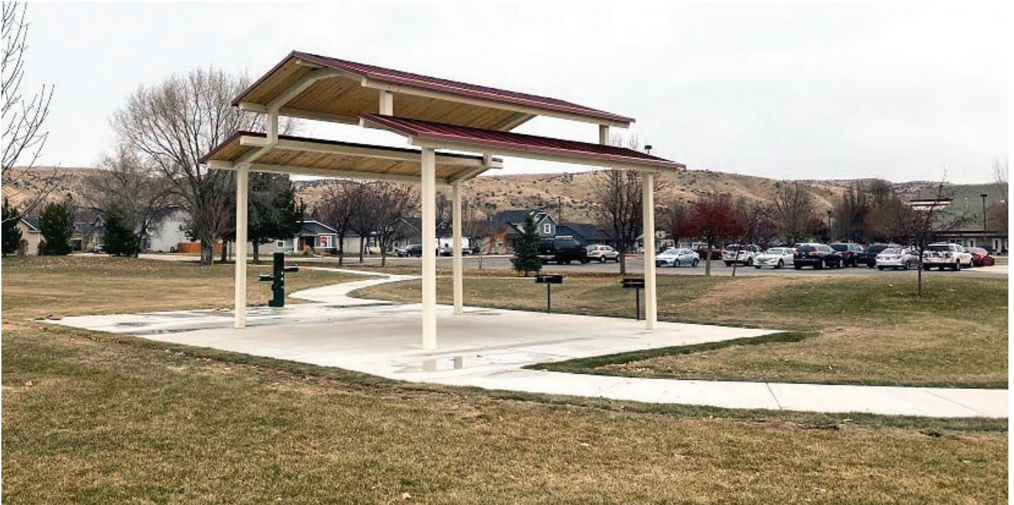
New picnic shelter in Magnolia Park