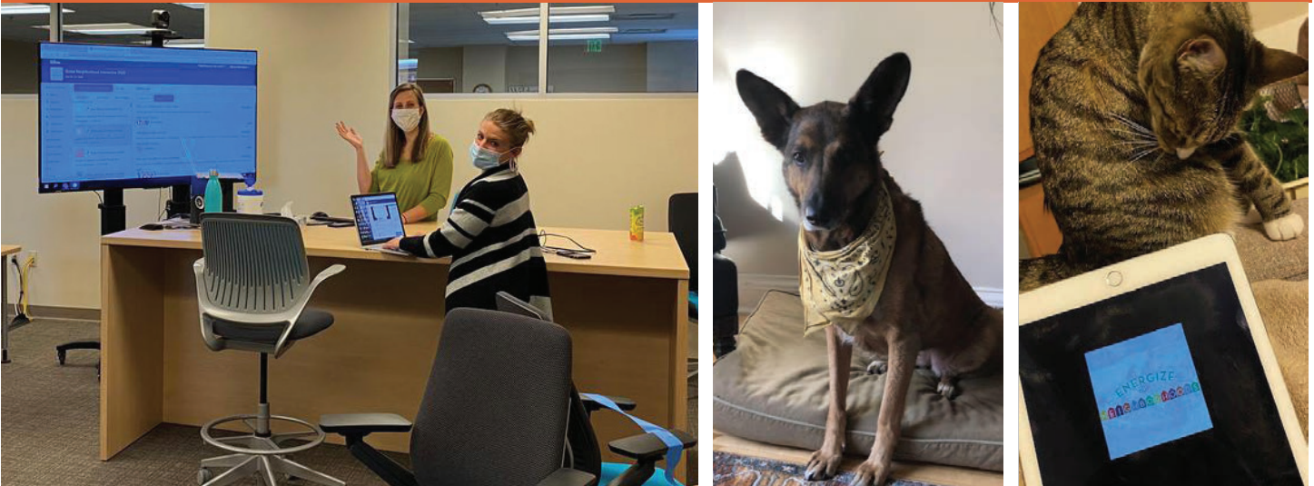
BNI attendees shared pet photos as part of a virtual conference and the Energize team kept things running behind the scenes.