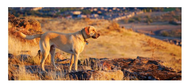
Dogs can run off-leash in designated areas of the Boise Foothills, as long as they do not disturb wildlife or cause a safety concern with other trail users.