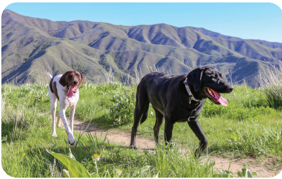
Dogs can run off-leash in designated areas of the Boise Foothills, as long as they do not disturb wildlife or cause a safety concern with other trail users.