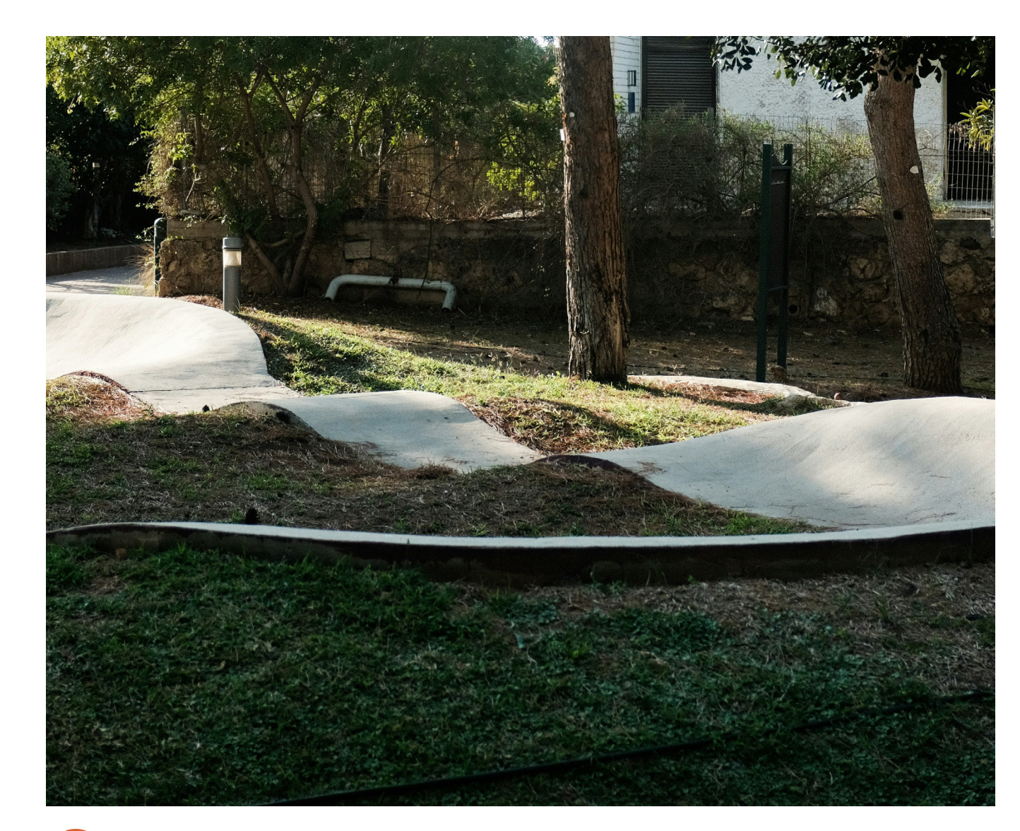
4 Bicycle Pump Track

All-season pump track for a variety of skill levels and ages.