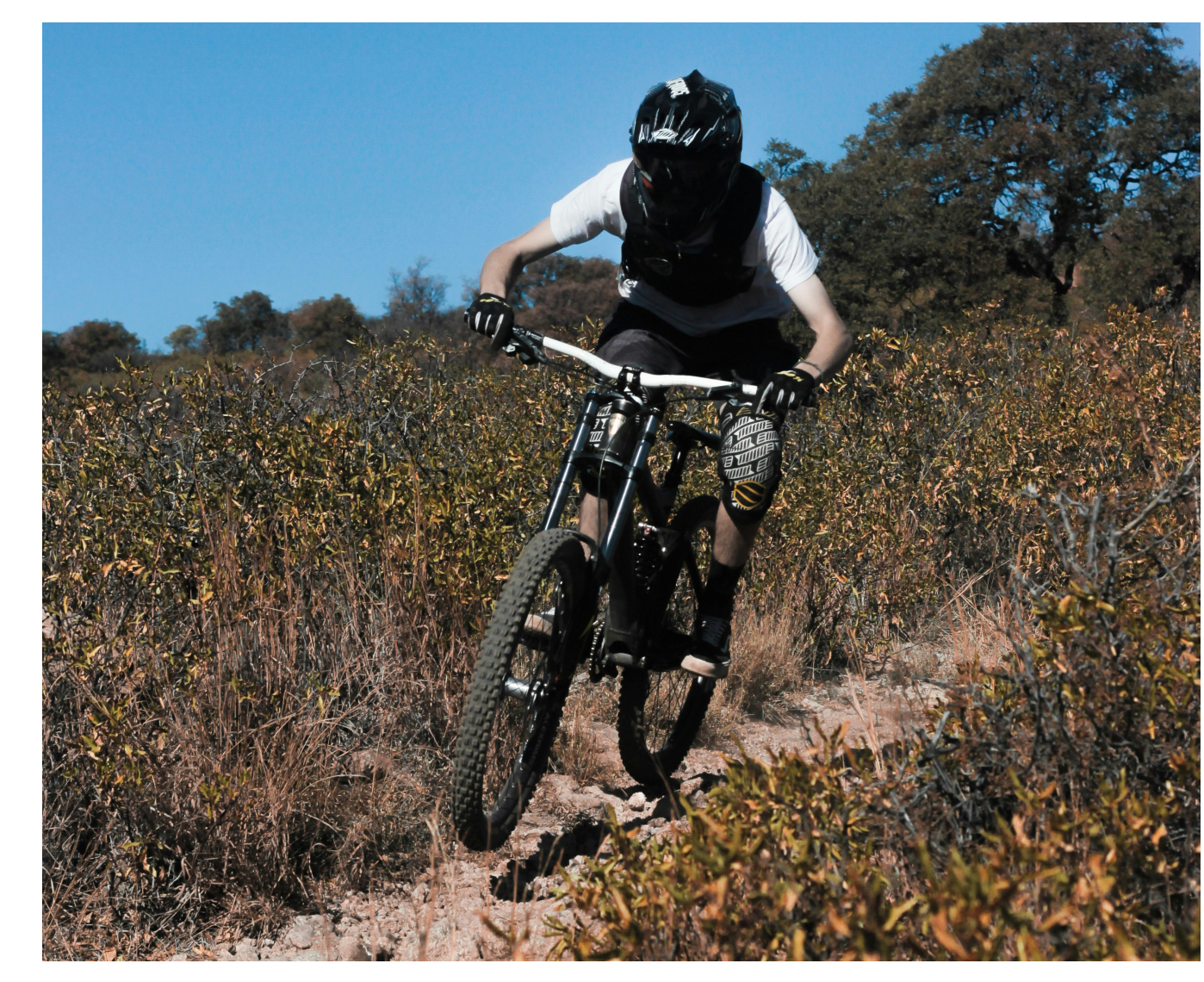
Bicycle Trails with minor features

Bicycle trails traversing contoured slopes through native plantings.