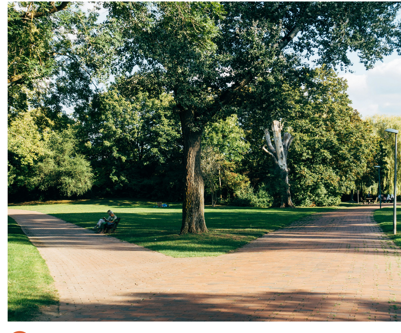
8 Park Entry Walk

Wide, inviting entry walk into park, complete with native planting beds, shade trees and seating.