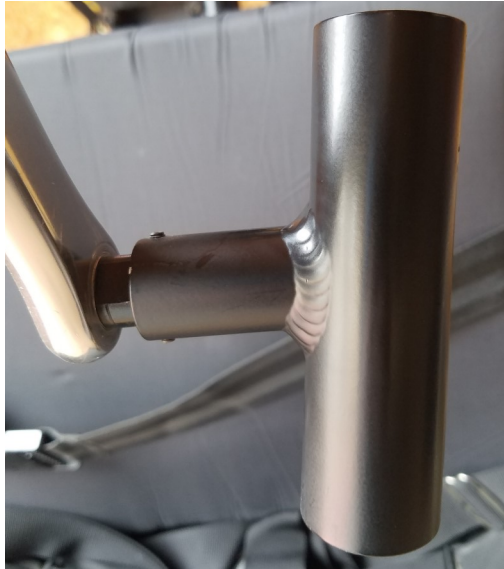
Standard hand pedal