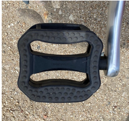
Standard pedal found mostly on our upright trikes

AdVenture has a variety of upright and recumbent tricycles, tandem tricycles and tandem cycles in small and large sizes. Some cycles also have the option of adaptive pedals shown below. Not all pedal systems will work with all cycles, please call 208-608-7680 to learn more.