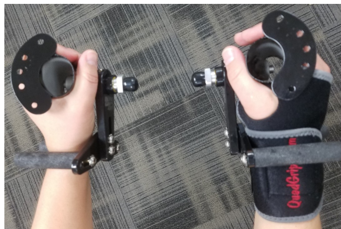
QuadGrip hand pedals from QuadGrips.com

“3-Point contact hand pedal similar to hand controls used for vehicles. Allows for the hands to be kept in place for peo- ple with limited grip strength. “