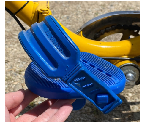
Standard pedal with adjustable foot strap, found on our upright trikes