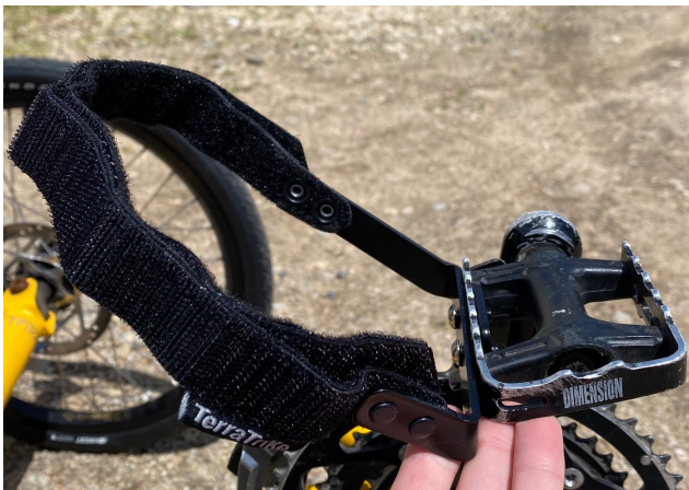
Standard pedal with adjustable heel strap, found mostly with our recumbent trikes