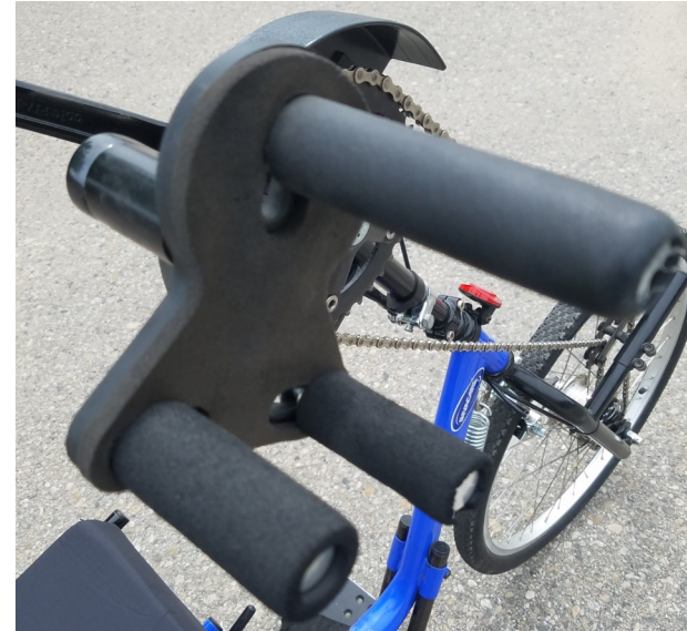
Tri-pin hand pedal from Invacare

“3-Point contact hand pedal similar to hand controls used for vehicles. Allows for the hands to be kept in place for peo- ple with limited grip strength. “