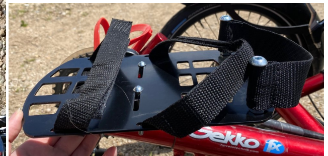
Adaptive foot pedals with ankle and toe straps, found on our recumbent trikes