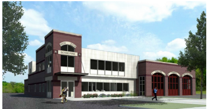
Fire Station #4 on Ustick Rd.

The city has also assisted private development projects achieve Green Building status. Projects include: