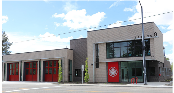
Fire Station #8 on Overland Rd.