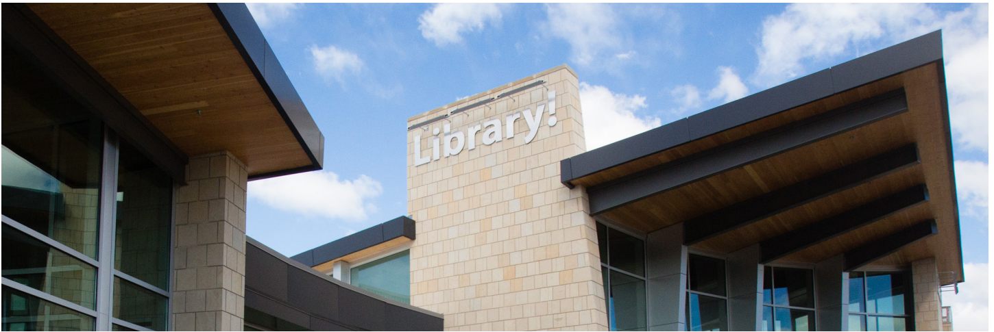
The Library! at Bown Crossing