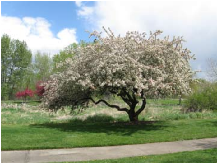
28 Crabapple , Malus spp Small. There are hundreds of varieties of crabapples each with their own flower, fruit size and adaptability. Spectacular in spring. Remember, flowers become fruit which can be messy in the wrong location.