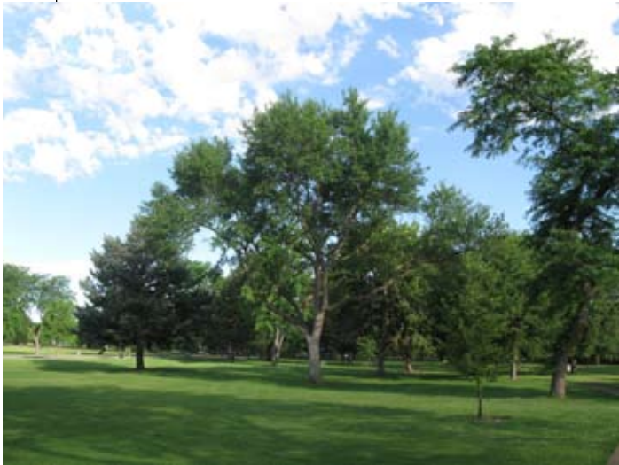
27 Green Ash , Fraxinus pennsylvanica Large. Adaptable and moderately fast growing. Tough, dependable and therefore overused. If kept in a vigorous healthy condition it will resist and withstand attack by Ash borers. Can have brilliant yellow fall color. Expect aphids.