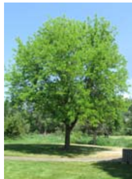
31 Honeylocust , Gleditsia triacanthos Large. Adaptable. Most varieties are thornless and seedless. Small leaflets provide filtered shade. Good, strong tree, a bit over used.