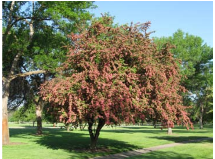
29 English Hawthorn , Crataegus laevigata Small. Adaptable. Impressive when fully bloomed in rosy red color. Difficult to keep clean and tidy.