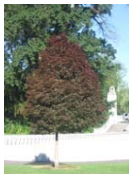
32 Crimson Sentry Norway Maple* , Acer platanoides "Crimson Sentry" Medium and narrow form. Somewhat adaptable. Columnar form of Crimson King. Good choice for narrow sites.