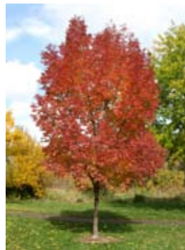
30 White Ash , Fraxinus Americana "Autumn Purple" Large. Adaptable and dependable when maintained in a vigorous condition. However a stressed condition will make it much more susceptible to ash borers. Excellent auburn fall color.