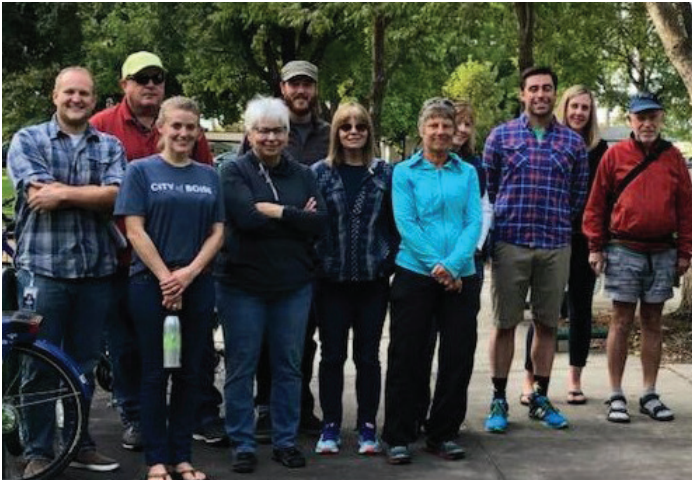
West End Neighborhood Tour Participants

EXPLORING BOISE'S BOUNDARIES neighborhood tour series provides an opportunity for participants to view and learn about public art, local history and current development, as well as an opportunity to meet local stakeholders and chat with City of Boise staff.