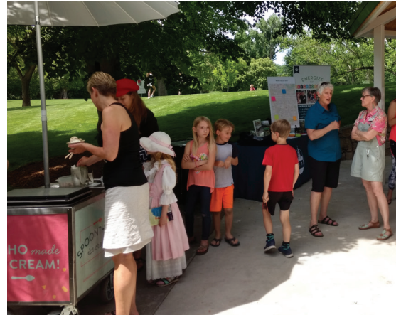
Ice Cream Social at Manitou Park