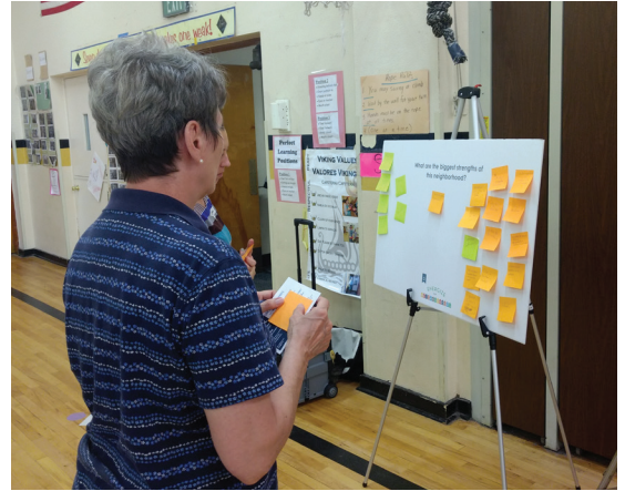
West End Neighborhood Association Annual Meeting at Whittier Elementary