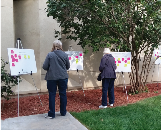
Visioning Event at King of Glory Lutheran Church