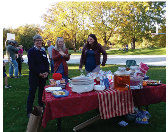
Fall Festival at Manitou Park