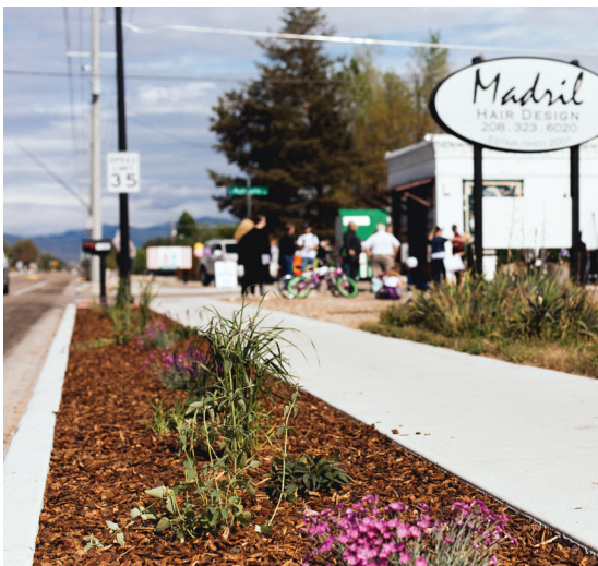
Ustick Townsite Landscaping