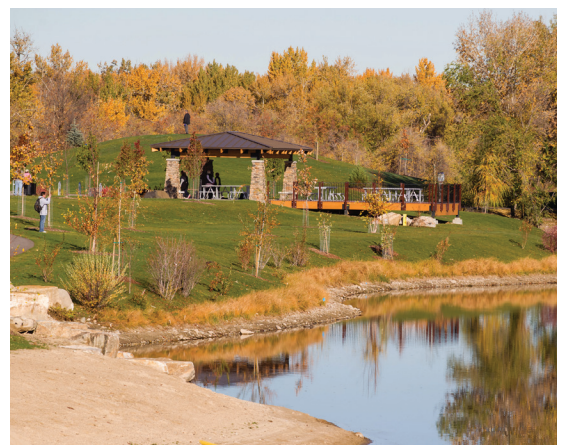
Esther Simplot Park