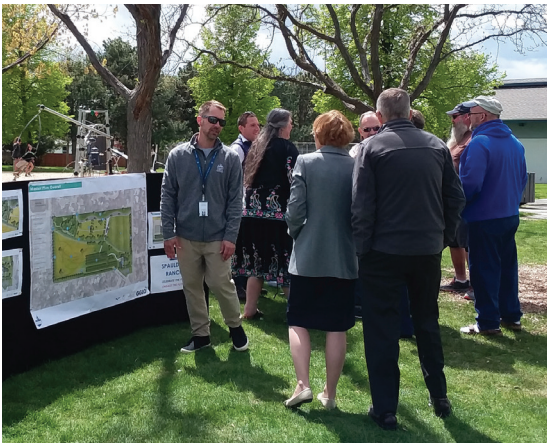
Visioning Event at Fairmont Park