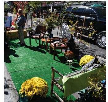
PARK(ing) Day at Boise City Hall