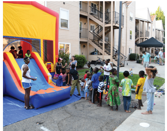
National Night Out at Davis Park Apartments