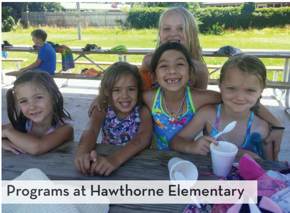
Programs at Hawthorne Elementary

The organizations have also discovered new opportunities to share resources, which will lead to improved programming options for students all across the Boise community.