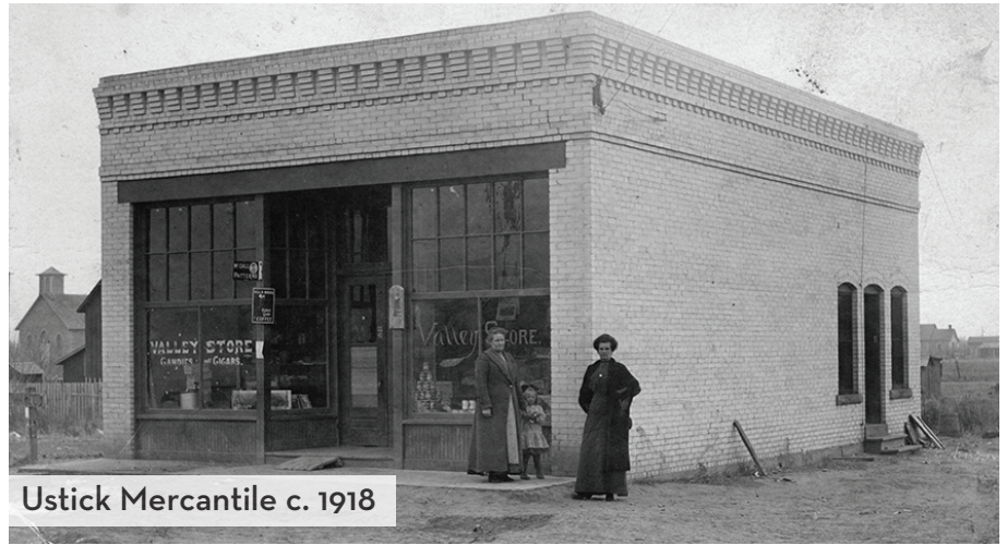
Ustick Mercantile c. 1918