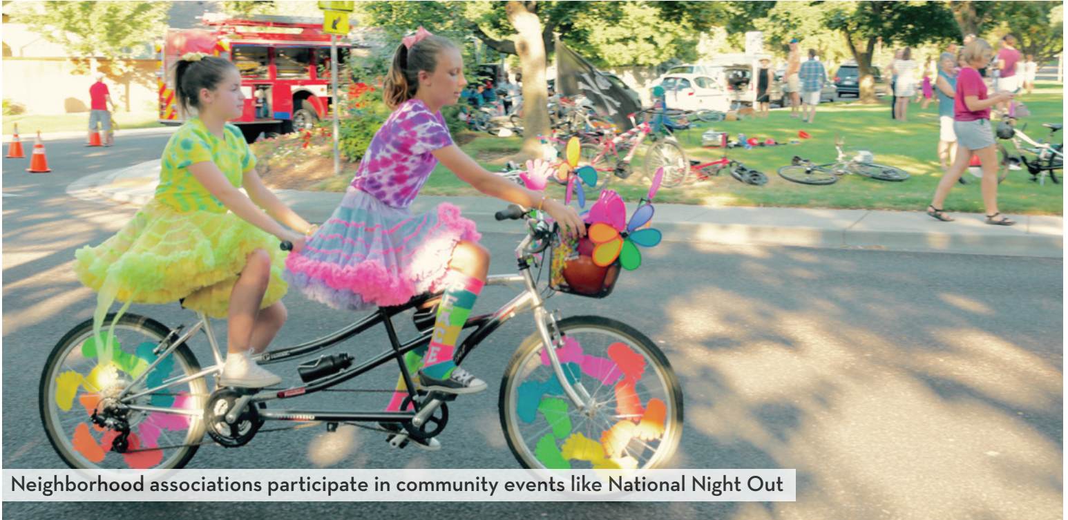
Neighborhood associations participate in community events like National Night Out