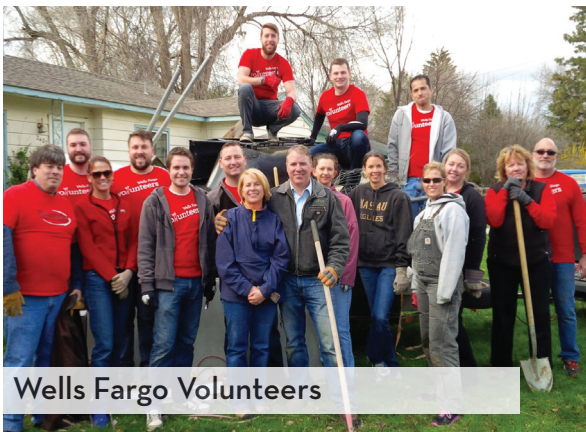
Wells Fargo Volunteers

Programs are available to help income-qualified families become homeowners. For information about NeighborWorks Boise and their pocket neighborhoods, go to neighborhoodhomes.org/pocketneighborhoods .