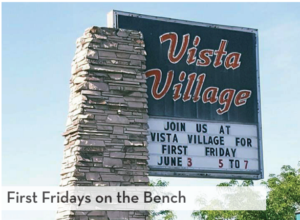
First Fridays on the Bench

To learn more about upcoming events, visit the Vista Bench First Friday Facebook page or follow #VistaBenchFirstFriday on social media.